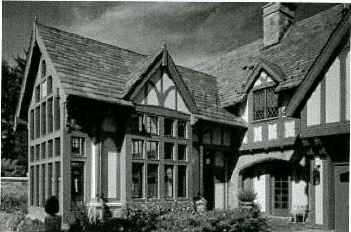
Rear view of 195 Sandringham Road, photo date unknown, designed by Arnold & Stern