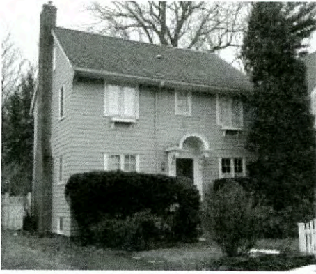
22 Menlo Place